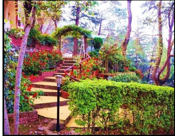
Kasauli Holiday Home View

The siren call of the Himalayas is irresistible. Despite the hill stations of Himachal Pradesh being rapidly developed with concrete jungles elbowing our mountain chalets and the summer stampede making many a gasp for some more cool mountain air, Kasauli has an air of bonhomie and conviviality. In the monsoon months, the Shivalik hills retreat into their peaceful cocoons. According to some, they are best when draped in burnished autumnal colors. Kasauli is situated at an altitude of 6300 ft. in Shivalik Hills, covered with pine trees.