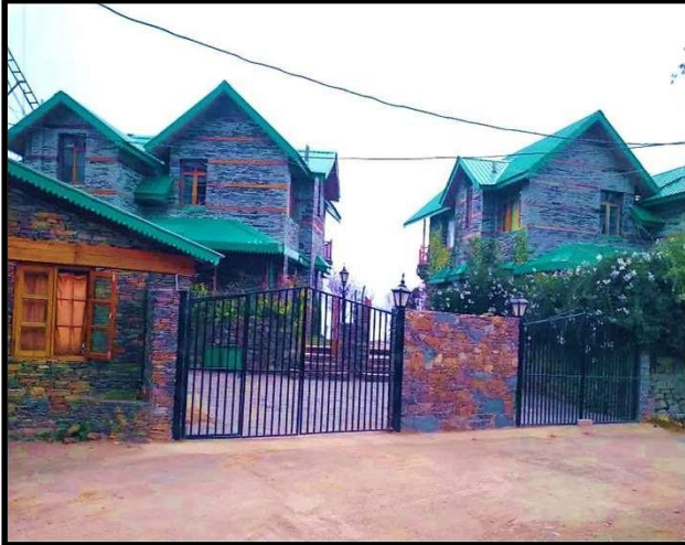
Holiday Home Entrance