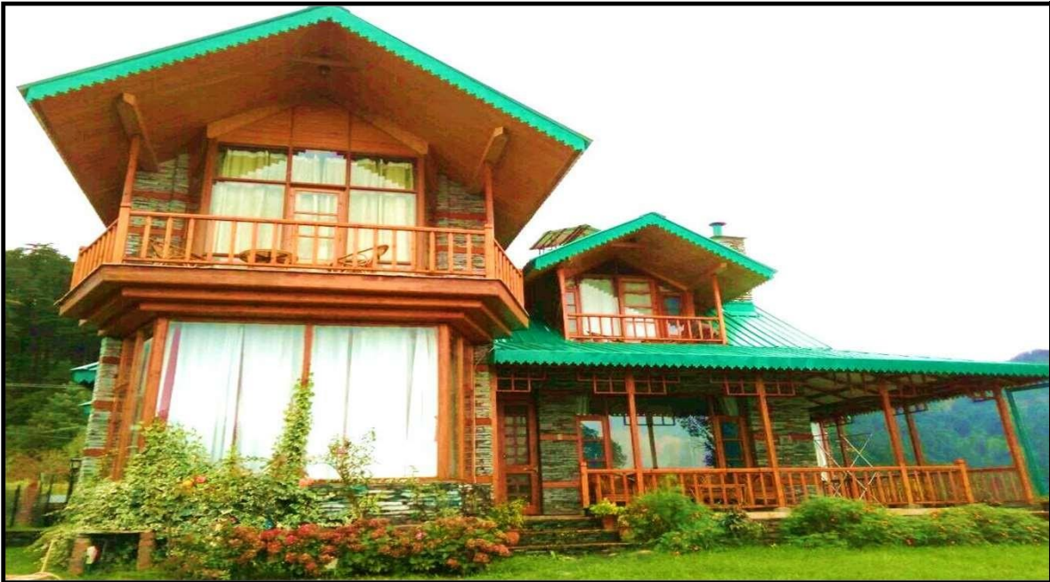
Dak Bungalow Holiday Home View

Dak Bungalow Holiday Home in, Kufri, Himachal Pradesh is a facility especially designed for Senior employees of L&T (Tier 2-C and above).